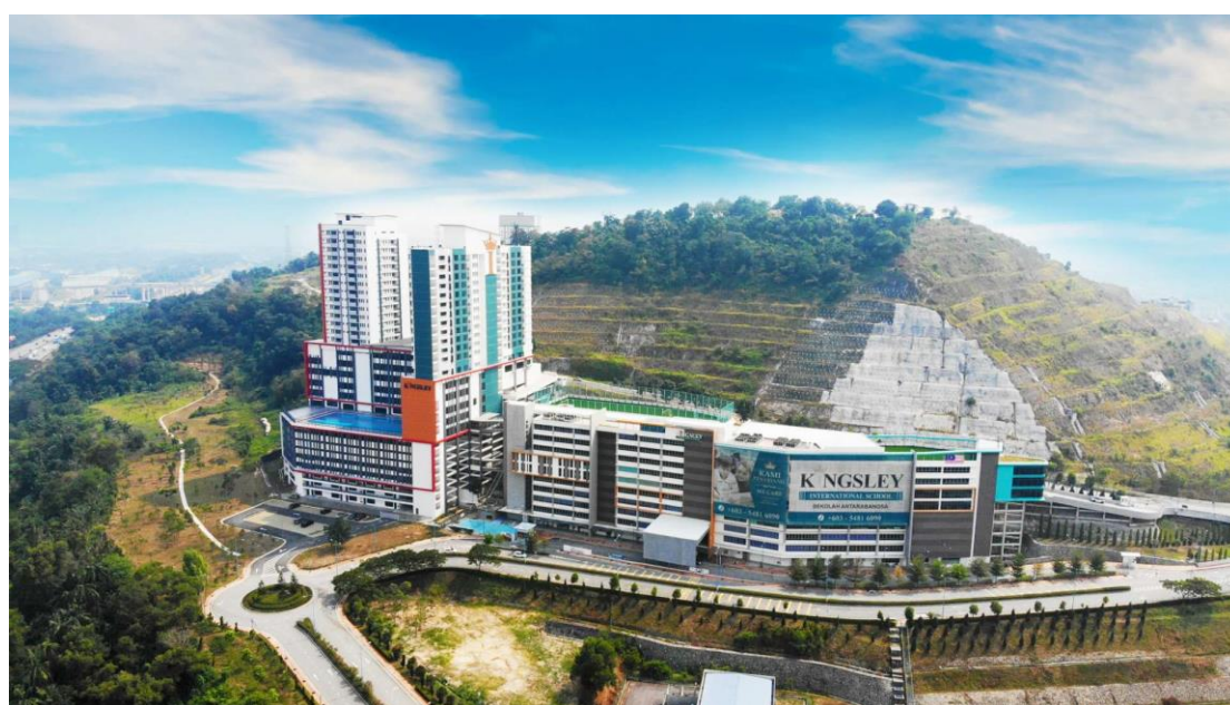
Kingsley School campus in Subang Jaya, Selangor, Kuala Lumpur, Malaysia

Kingsley owns two buildings and the free hold land associated with them. With a total floor area of 94,000 sqm, one is a 10-story building and another a 2-tower hostel of 13 and 15 stories. The school's state-of-the-art facilities include a fully-equipped cafeteria, an indoor swimming pool, an Olympic size outdoor swimming pool, two libraries, a gymnasium and several multipurpose rooms and halls. The dormitory area covers 49,518 sqm which can host more than 800 boarding students. These assets are currently valued at more than HK$400M.