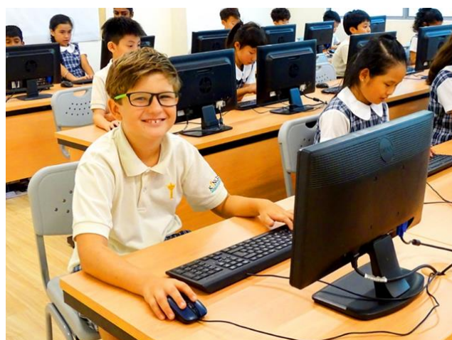
Kingsley students in computer lab

Should the offer to Kingsley shareholders be accepted, MLE will prioritize profitability through offering its high-quality international K-12 program to students from Malaysia, Singapore and other South East Asian countries. In addition to the current A-level and other advanced courses at the high school level, we will introduce our Maple Leaf Chinese as Secondary Language (CSL) curriculum, as co-developed and approved by China’s Confucius Institute. Aside from its K-12 programs, Kingsley currently offers some post-secondary educational services, which MLE intends to deregister.